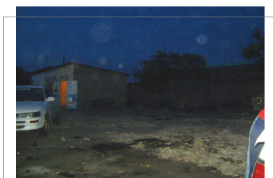
A venue where clients frequent when looking for sex workers

However, the respondents said they also felt uncomfortable in these places because of the way people looked at them (some people look down upon them), they are easily identifiable even by non-clients, some clients bully them, and police harass them.