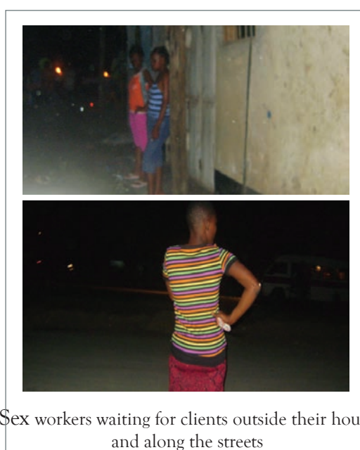
Sex workers waiting for clients outside their houses and along the streets

The qualitative results indicate that the clients are targeted in different places e.g. bars, restaurants, casinos, etc. Up-market or expensive sex workers usually frequent casinos, hotels, night clubs or discos. Some own their own houses and they are called by clients from their houses. Low market or less expensive sex workers can be found sitting outside their houses, bars, pubs, night clubs, etc. Sex workers who operate in ‘sex houses’ can be found in brothels. Sex workers who have other occupations can be found in bars. These venues are selected based on various reasons including a high concentration potential clients, company and protection from other sex workers, and their clients are aware that they would be found in these places.