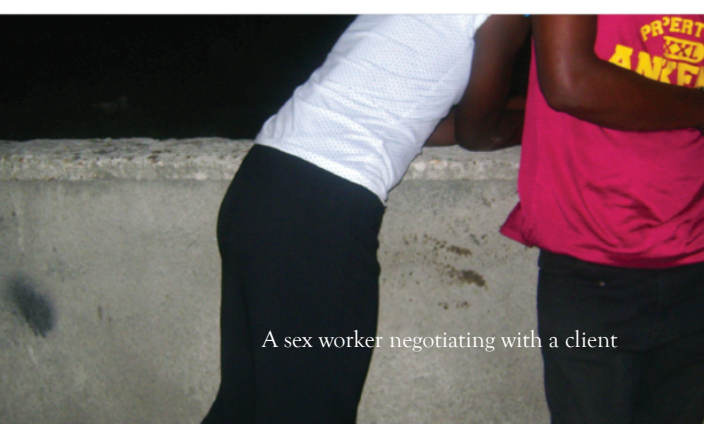
A sex worker negotiating with a client