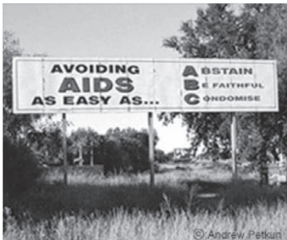
A roadside sign in Botswana - late 1990s

transmission, behaviour change for individuals, harm reduction for injecting drug users, and precautions for health care workers. One of the most common prevention measures is the 'ABC approach' (abstinence, be faithful, use a condom).